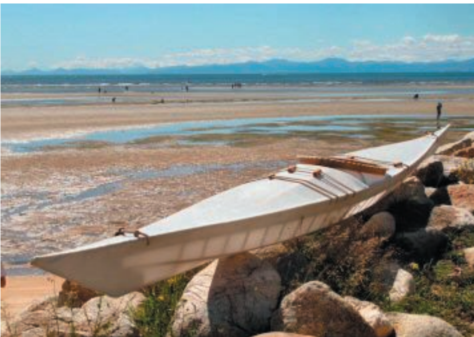
AT MARAHAU BEACH IN THE ABEL TASMAN NATIONAL PARK

There are a number of paddlers in New Zealand that use Greenland paddles but not that many Greenland SOF kayaks as far as I know. I am sure the number of kayaks will grow as Greenland techniques become more popular. Most of the Greenland paddle users have also built their own boats. These are mainly S&G and strippers,