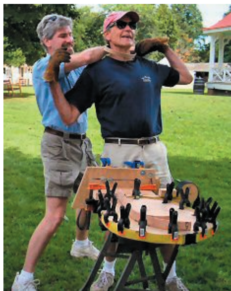
THE NECK BEND

Since dry stock retains its bent shape better, it would be the preferred choice for use with forms and particularly with an adjustable form. An article by Brian "Building an Adjustable Rib Bending Jig" is available on-line in the Summer 2004 MASIK . The ribs will come off the form(s) after a few minutes of cooling with little spring back and be ready to insert into the frame. Once in, their shape should remain stable.