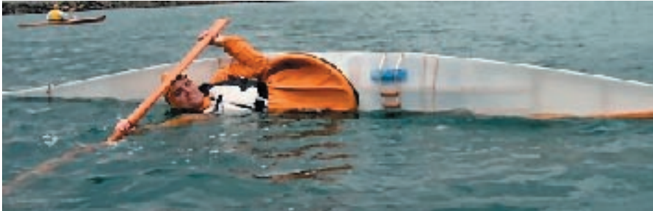
EMBRACING GREENLAND PADDLING IN NEW ZEALAND